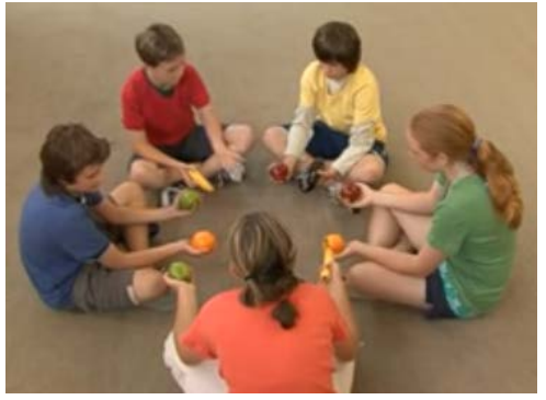
Figure 2: Students play the orange game to explore how a router works. Source: CS Unplugged website classic.csunplugged.org/routing-and-deadlock/creativecommons.org/licenses/by-nc-sa/4.0/