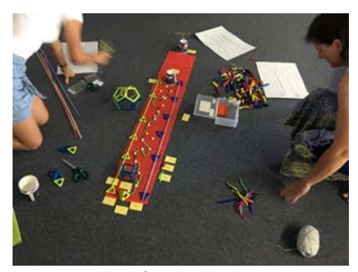
Figure 1: Teachers from Crossways Lutheran School build their own model of the internet