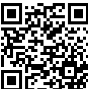
Figure 3: QR code 3

There are a number of resources available to create your own QR code. Here is an example: www.the-qrcode-generator.com/