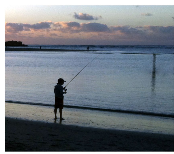
For copyright purposes the photo has been replaced.

Write an opening paragraph for a short story using the above picture as your prompt.