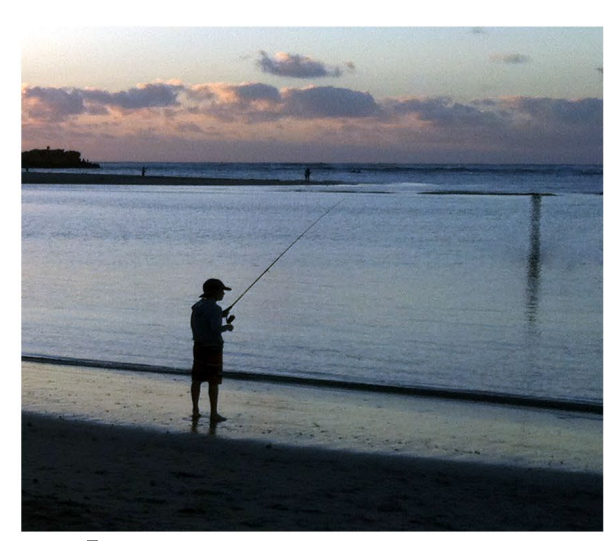
For copyright purposes the original photo has been replaced

Write an opening paragraph for a short story using the above picture as your prompt.